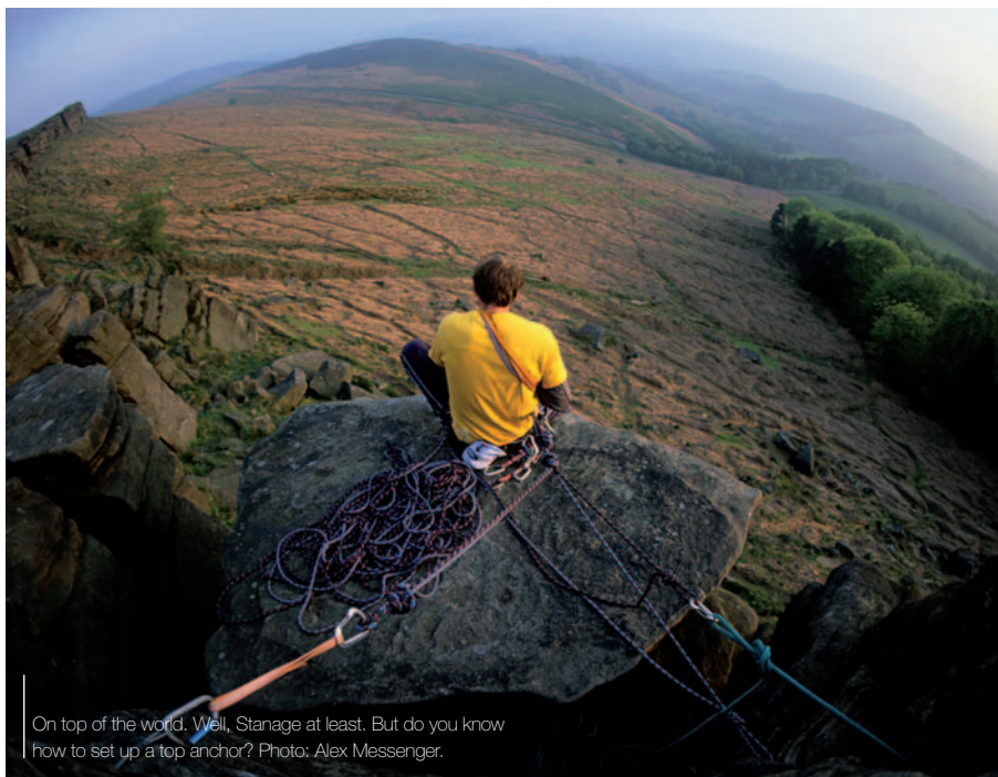
On top of the world. Well, Stanage at least. But do you know how to set up a top anchor?

Always err on the side of caution. It's an art not a science, so build redundancy into your systems. There are five common types of hand placed protection: nuts, hexes, cams, threads and spikes. Nuts and hexes wedge into narrowing constrictions in the rock. You should try to maximise the amount of metal in contact with the rock, as this will make the placement more stable. Deeper placements can be more secure, as more rock is being used. Cams come in many different sizes for a multitude of crack widths - but when placed correctly the cam should be neither fully expanded nor fully closed, but with all four teeth open roughly equally. For all these types of protection you need to judge how strong the rock is - the best placed cam is no good if the surrounding rock is weak or rotten. Finally, think about the direction the gear will be pulled in. Again, you may place the perfect piece of kit in a solid piece of rock, but then load it in an unexpected direction and pull it straight out. Threads and spikes are usually great things to find at the top of a climb and can make your life